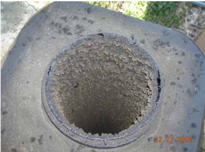
Creosote such as this can usually be brushed out

The creosote is a sticky substance (composite mixture of tars, soot and other secondary products of combustion) with unpleasant odor, easily flammable and with a corrosive effect.